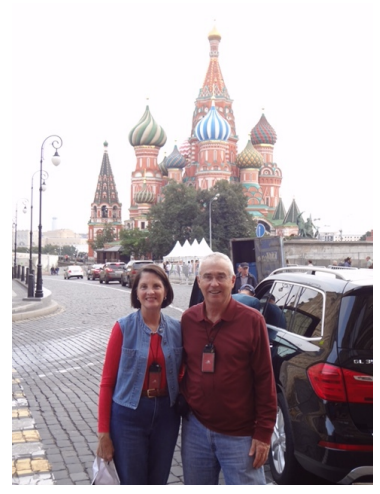
We are standing in Red Square, with Saint Basil's Cathedral in the background.

In late September, we traveled to Finland and Russia. After four days of touring the beautiful and very walkable city of Helsinki, Finland, we went by train to St. Petersburg, Russia. There we spent another four days of touring, which included the Hermitage, Catherine's Palace and the Fabergé Museum. We next boarded a Viking river boat for a cruise that traveled down the Neva, Svir and Volga rivers, and crossed several large lakes, ending in Moscow. Along the way we make many interesting stops. In Moscow, we visited the Kremlin, Red Square, and took a late night canal cruise through the well-lit beautiful city. We also were treated to a performance by a symphony orchestra that used traditional Russian musical instruments.