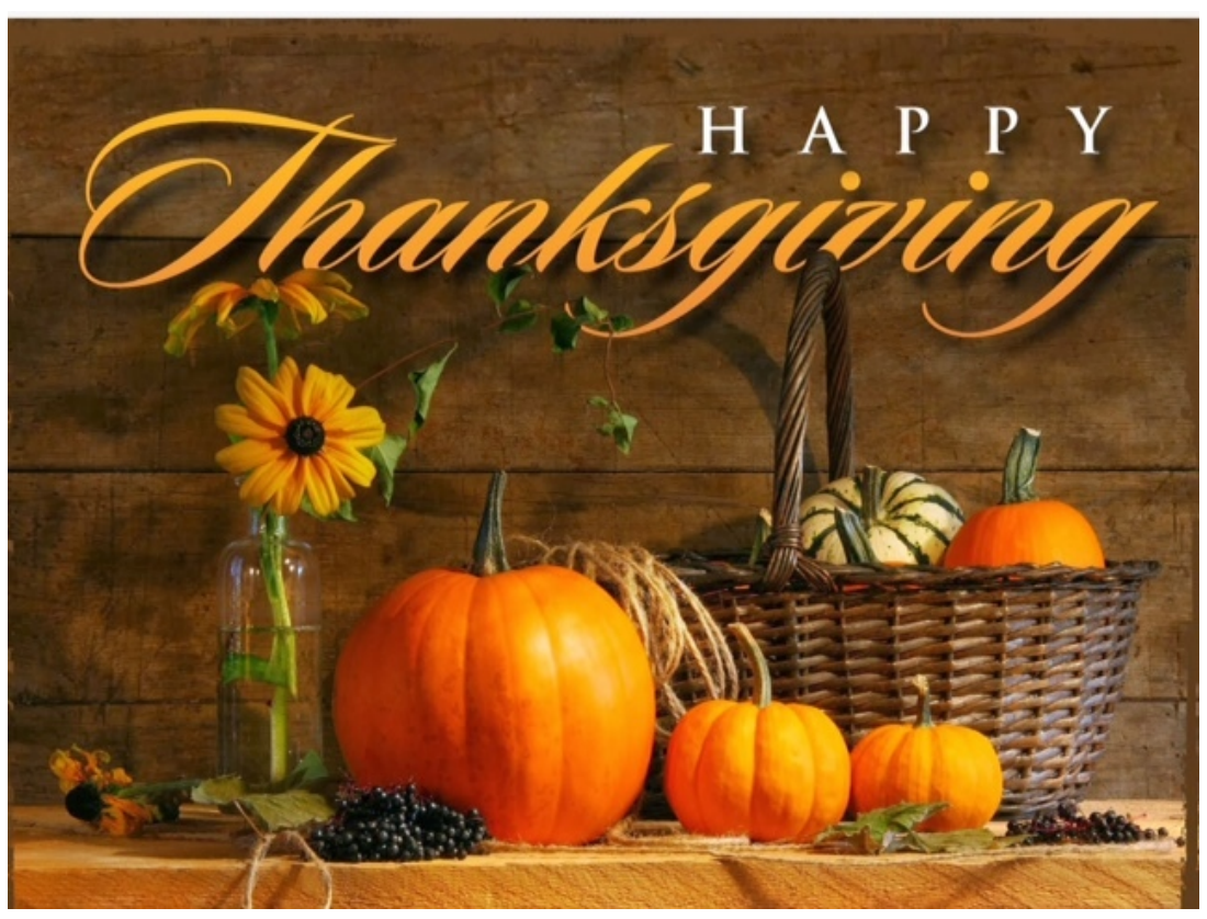
Did the first Thanksgiving take place in Virginia, not Massachusetts? (click on image for more information from an article in the Washingtonian Magazine).