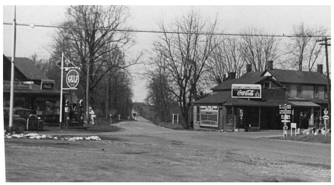
Tysons Corner, 1936. For more information click on image.