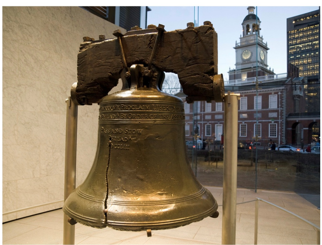
The word "Pennsylvania" is misspelled on the Liberty Bell.