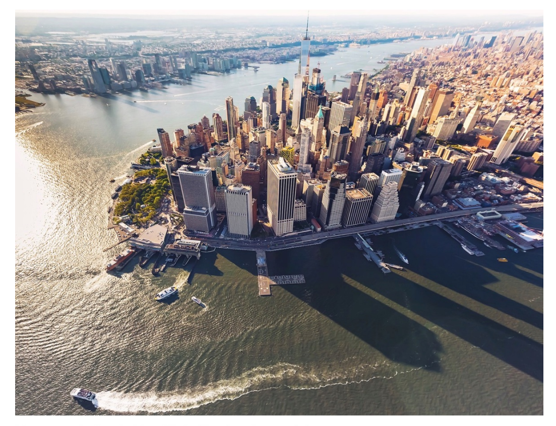
More people live in New York City than in 40 of the 50 states.