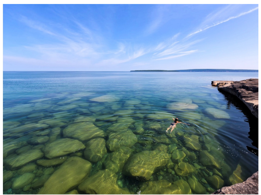
There is enough water in Lake Superior to cover all of North and South America in one foot of liquid.