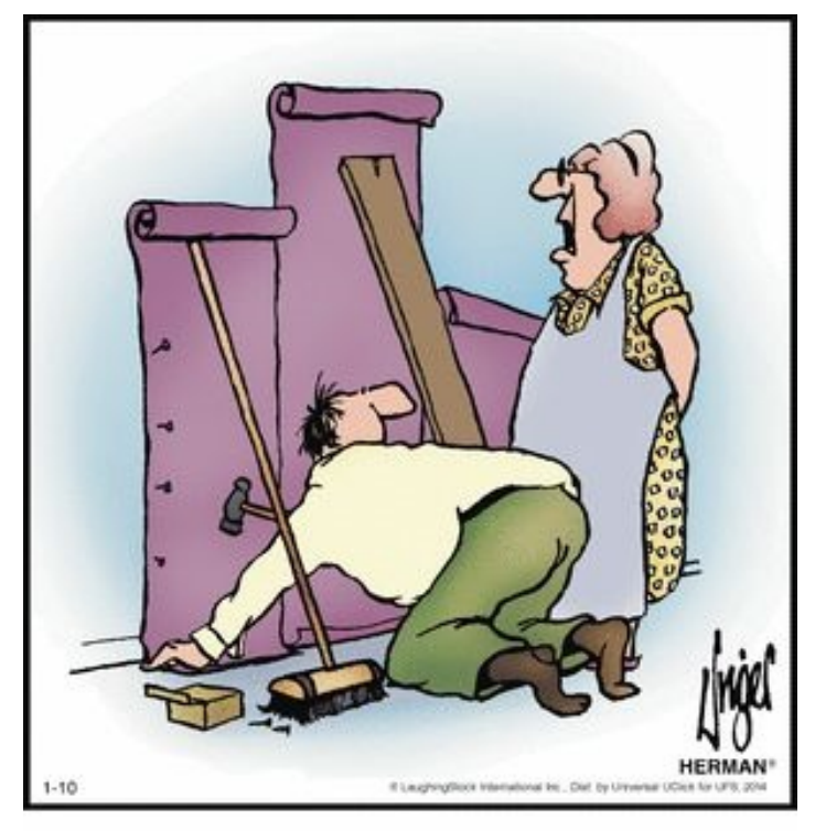
"It's hard to believe you've never put up wallpaper before."