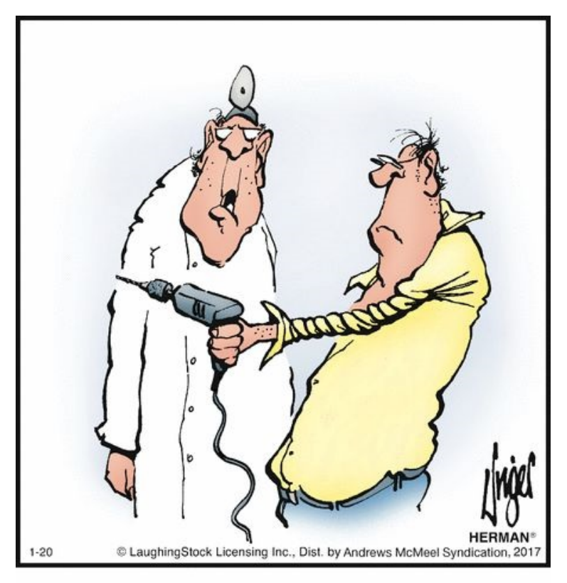
"Is there a reverse switch on the drill?"