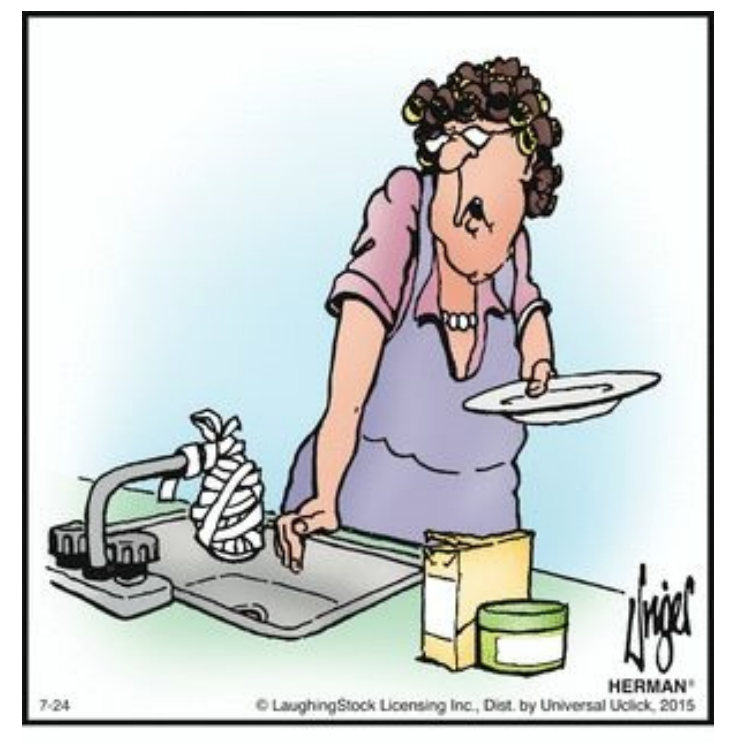
"I see you've fixed the drip!"