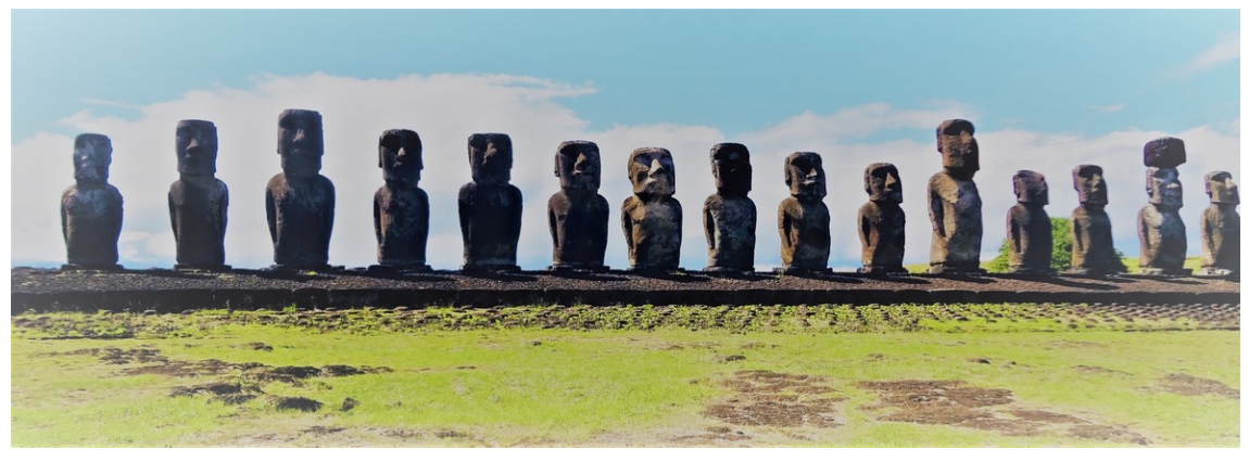
Restored Moai on Easter Island

there are collectively 250 separate falls, making it the widest water falls in the world.