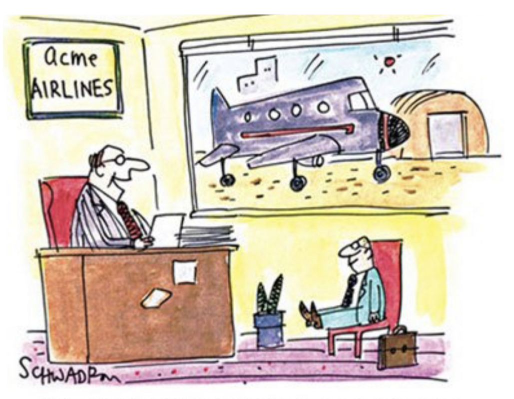
"You're just the kind of person we're looking for to test our airline seats."