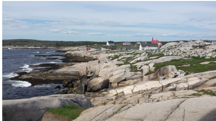
Peggy's Cove, Nova Scotia

townsfolk. There, we visited the Bay of Fundy (known for its high tides), toured several top-class wineries, hiked along the beautiful shore and chatted with the friendly locals.