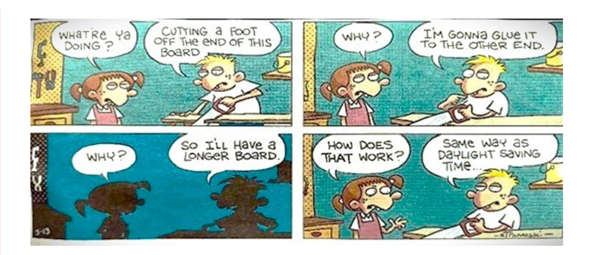
Daylight savings time begins at 12:01am on March 10