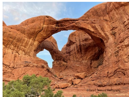
Double Arch Window in Arches National Park

On my way south to Santa Fe, I made a quick detour to Mesa Verde NP in Colorado.