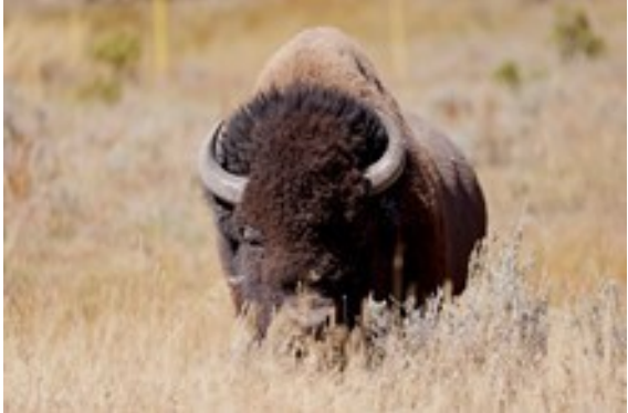
Bison in Yellowstone National Park