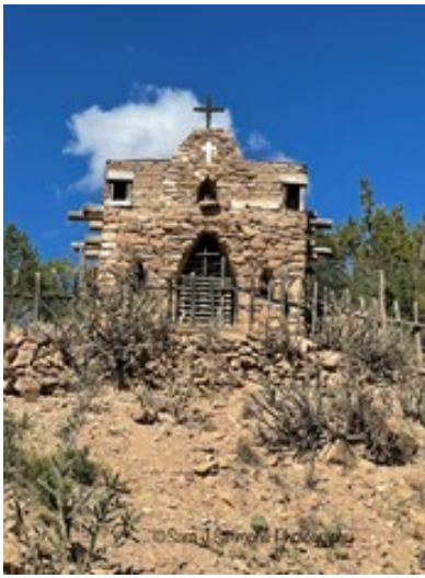
La Capilla de San Ysidro Labrador / Lopez Chapel, Santa Fe