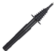
test probe with banana socket; 1 kV; black