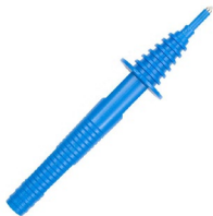
pin probe, blue 1 kV (banana socket)