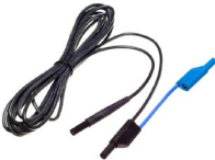
test lead 5 m, black, 1 kV (banana plugs, shielded)