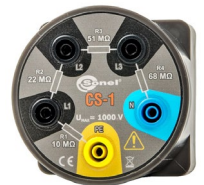
CS-1 cable simulator