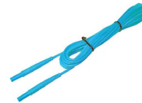
test lead 5 m, blue, 1 kV (banana plugs)