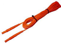
test lead 5 m, red, 1 kV (banana plugs)