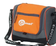
M-6 carrying case