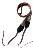
meter strap (type M-1)