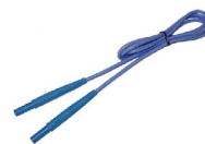
test lead with banana plugs; 1 kV; 1.2 m; blue