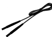
test lead with banana plugs; 1 kV; 1.2 m; black