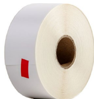
label roll – black on white for D2 printer (SATO) WANAKD2