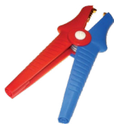
Kelvin crocodile (2 pcs.) WAKROKELK06