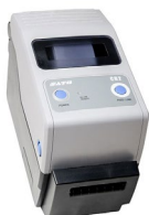
D2 portable USB report / barcode printer (Sato) WAADAD2