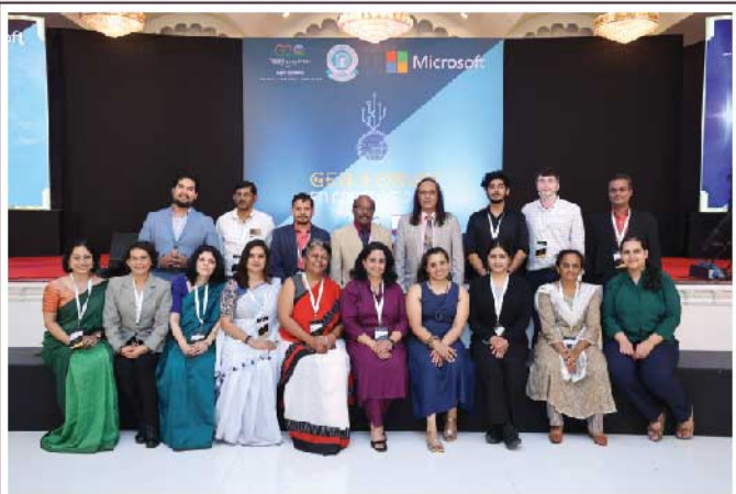
Team of Tech Avant-Garde