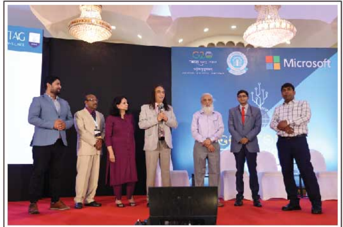
Launch of Bon Ami Students' card