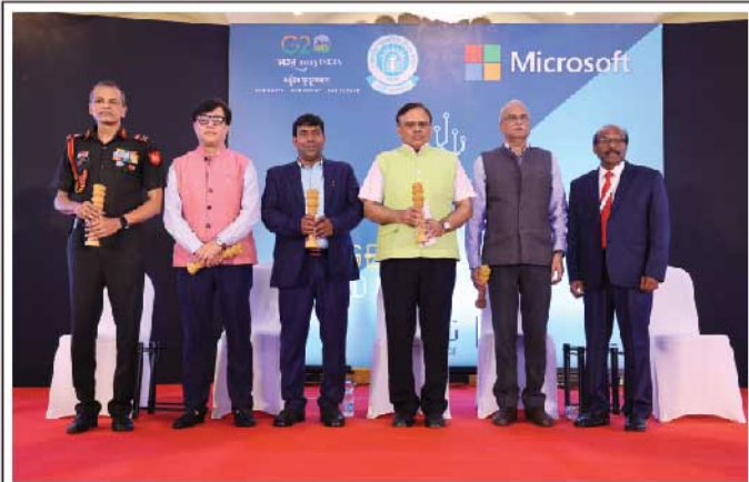
Facilitation of Keynote Speakers