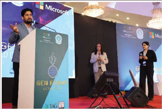
Brief on Project Carte Blanche