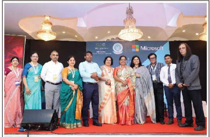
Participants of Bangalore Sarvodaya