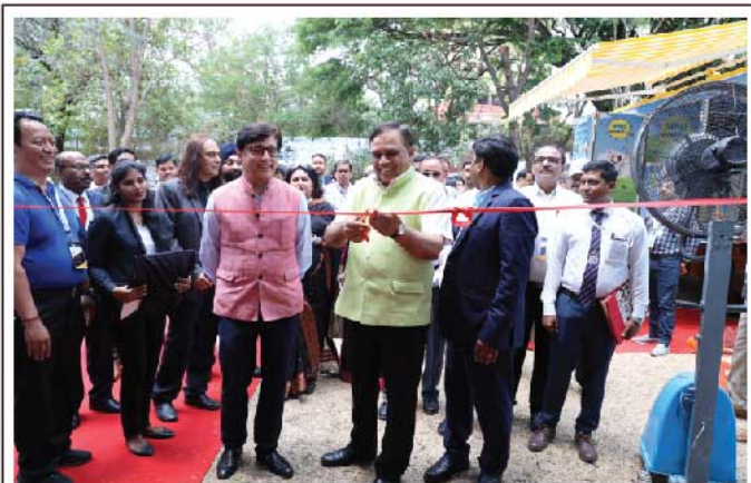
Inauguration of the Pavilion by Chairman AICTE