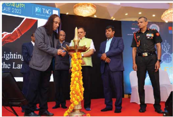
Lighting of the Lamp Ceremony