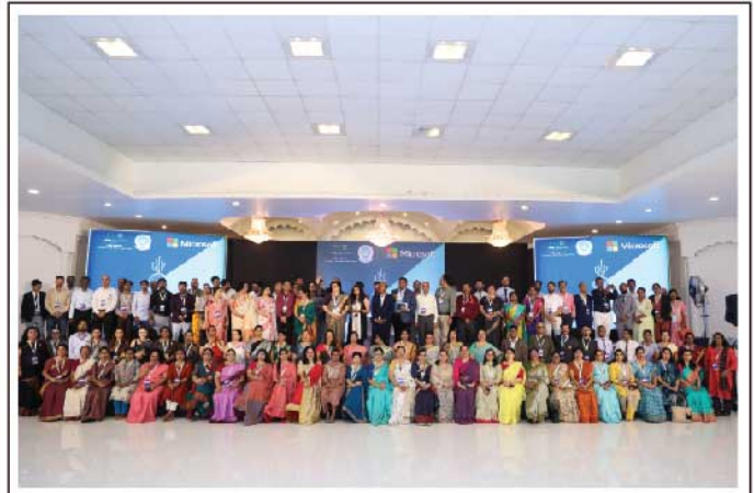
Galaxy of Educators and Principals from all over India