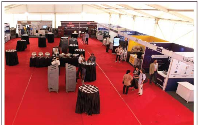
Exhibition Centre in the Pavilion