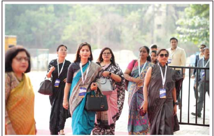
Participants joining the Gen Forum