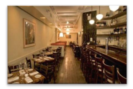
Chipotle I GL I 7,000 sq. ft.