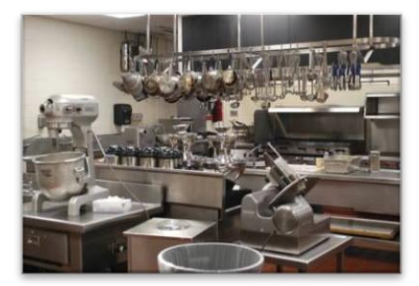
Fabric I GL I 8,000 sq. ft.