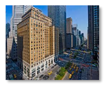
SMI – 129 West 29<sup>th</sup> Street