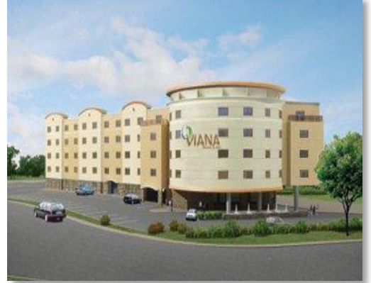
Firmdale Hotel I 18Stories I 100,000 sq. ft.

Hampton Inn I 30Stories I 141,000 sq. ft.