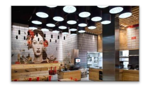
Digg Inn Restaurant I GL I 5,000 sq. ft.