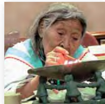
TOP ©NATIONAL MUSEUM OF CANADA PHOTO 39726