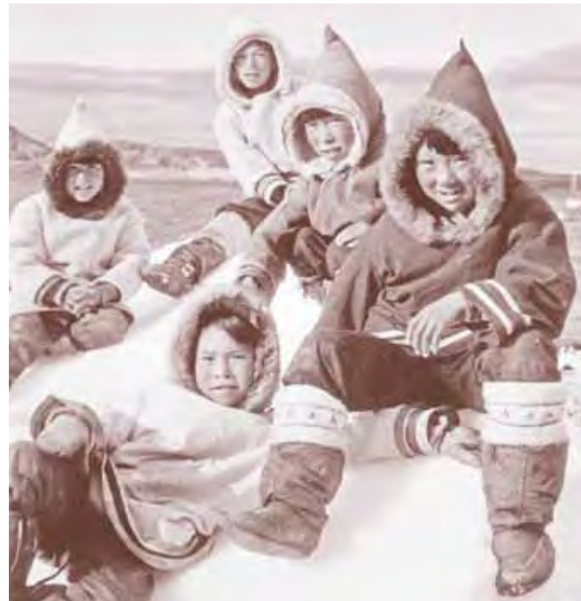
TOP Two sisters.