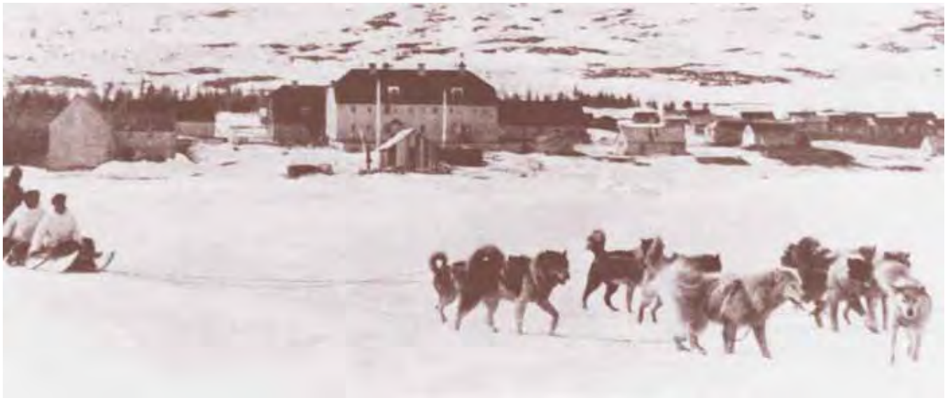
Nain Labrador c.1910

Structures have been established to ensure the Inuktitut language is kept alive and strong and Inuit culture is retained and strengthened. In fact, Inuktitut is one of the very few Aboriginal languages in the world that is not in