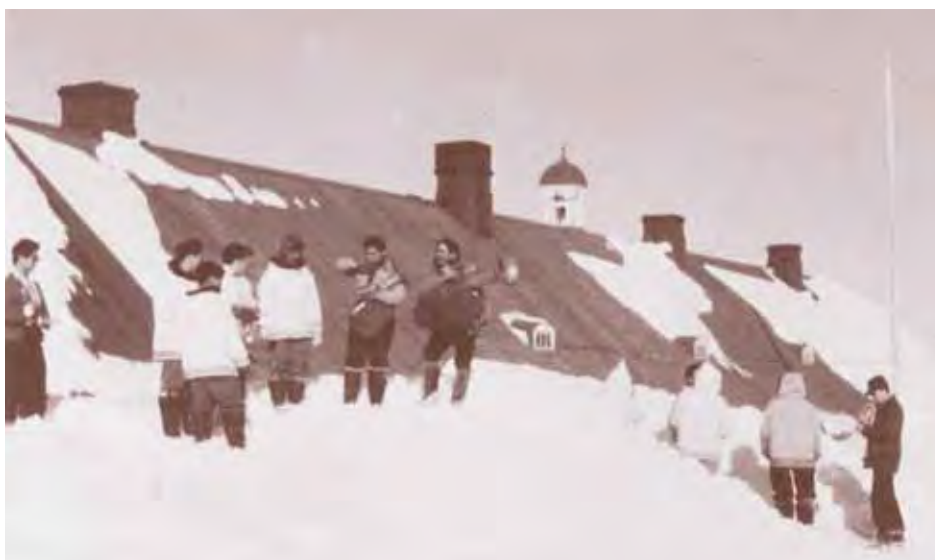
Hebron Labrador (Moravian Church) c.1910

The Inuktitut language came under stress as many children attended residential schools that strictly forbade the speaking of the language. Residential schools caused a wide range of misery and hardship for Inuit as they disrupted the transmission of traditional culture and values, weakened the link between generations and caused immense grief and frustration for many families.