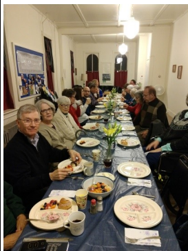
Waiting patiently for the pancakes

Health and Safety in the time of the Coronavirus: We'll be discussing ways to protect ourselves and each other following Sunday's worship. As you know, handwashing is the first line of defense, and we may change the way we greet each other at The Peace and make some small adjustments in the way the bread and wine are distributed. Hand sanitizer is available in the church. Common sense is our best protection.