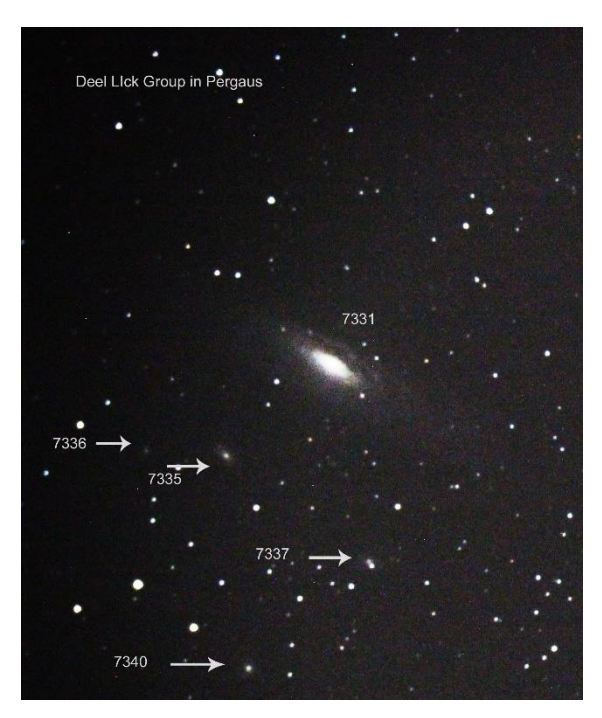
Deer Lick Group in Pegasus taken by the author

difficult to see), and 7319. NGC 7320 is not a member of the group only 35 million light years away, the others are 300 million light years distant.