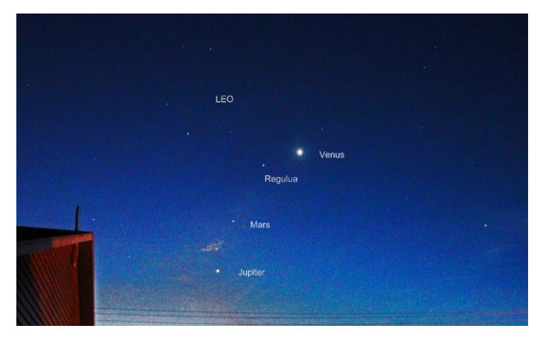
Venus, Mars and Jupiter looking east in Leo before sunrise, Oct 5, 2015 by the author

above, Venus in the middle and Mars below November 1: Another triangle with Jupiter above, and Mars across from Jupiter.