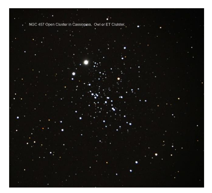
NGC 457 the Owl or ET cluster in Cassiopeia by the author

The Bubble Nebula, NGC 7635, a diffuse Nebula in Cassiopiea. This object is a challenge. You will need to use averted vision. A magnitude 8 star in the nebula, and a magnitude 7 star to the west makes it hard to see. It is caused by a fast stellar wind from a hot, young central star near the center that is clearing a roughly arc shaped opening around the star. It lies about 10,000 light years distant.