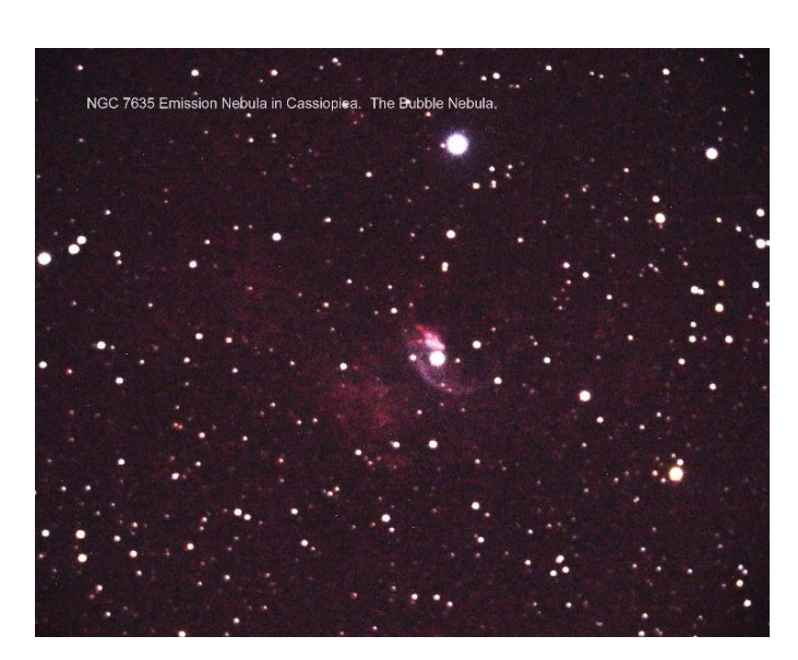
NGC 7635 the Bubble Nebula in Cassiopeia

The Bubble Nebula, NGC 7635, a diffuse Nebula in Cassiopiea. This object is a challenge. You will need to use averted vision. A magnitude 8 star in the nebula, and a magnitude 7 star to the west makes it hard to see. It is caused by a fast stellar wind from a hot, young central star near the center that is clearing a roughly arc shaped opening around the star. It lies about 10,000 light years distant.