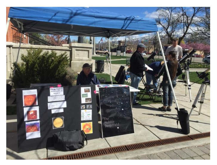
CVAS shares the Sun during earth day celebration

There was a very large sunspot group which could be observed even without magnification (though solar glasses). In addition, there were several very nice prominences and filaments that could also be observed.