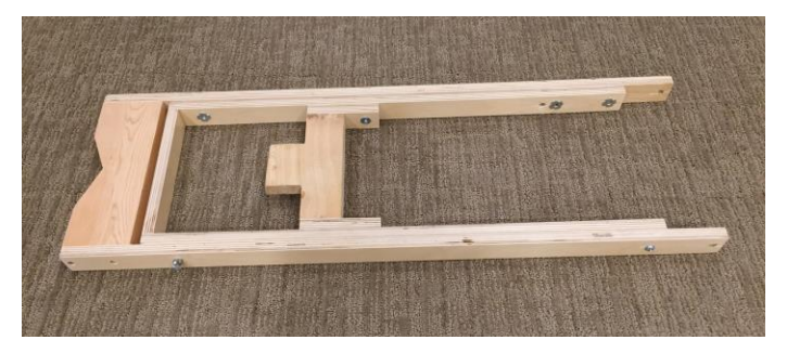
Binocular support (folded for storage)