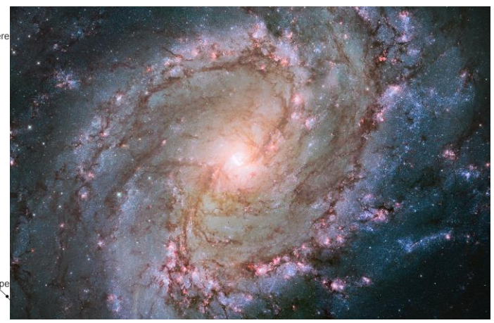
Hubble Space Telescope Image of Messier 83 (The Southern Pinwheel Galaxy)

The constellation Hydra, the Water Snake is the largest and longest of the 88 modern constellations. It covers over seven hours in right ascension! It only has one fairly bright star, second magnitude Alphard, the orange heart of the snake. However, the six stars in its head form a recognizable asterism.