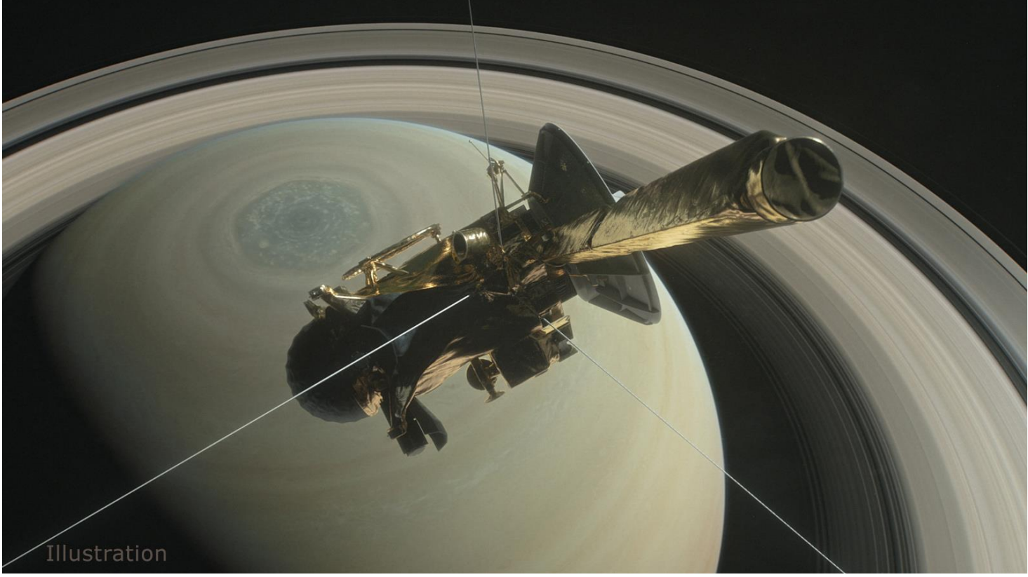
This illustration shows Cassini above Saturn's northern hemisphere prior to one of its 22 Grand Finale dives.

NASA's Cassini spacecraft, in orbit around Saturn since 2004, is about to begin the final chapter of its remarkable story. On Wednesday, April 26, the spacecraft will make the first in a series of dives through the 1,500-mile-wide (2,400-kilometer) gap between Saturn and its rings as part of the mission's grand finale.