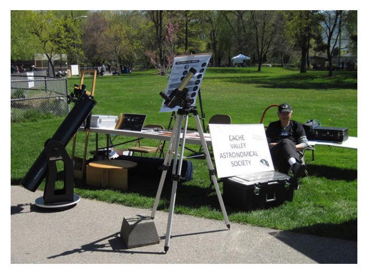
CVAS Booth at the Zootah Event

and adjusting the telescopes to keep them pointed at the Sun. Considering the weather that we have been having and the relatively quiet state of the Sun, we were extremely lucky to have a clear sky and sunspots to observe!"