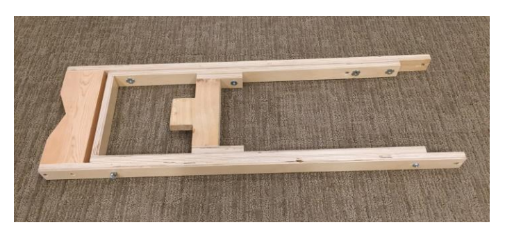
Binocular support (folded for storage)