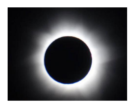
Total Solar Eclipse