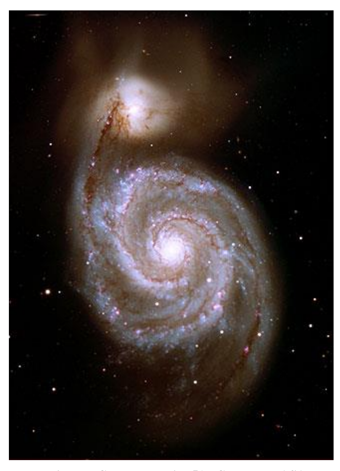
Whirlpool Galaxy, Messier 51