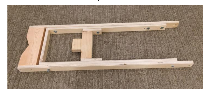
Binocular support (folded for storage)