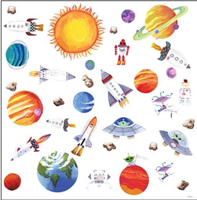
Pictured: Roommates Wall Decal $9.99 on Amazon.com

There are tons of great space stickers out there, besides these. Both boys and girls enjoy using glow-in-the-dark stars to make their own constellations on their walls and ceilings. These planet, spacecraft, and alien stickers are a ton of fun, too. We have peeled them off the ceiling and repositioned them once, with no ill effects to stickers or ceiling.