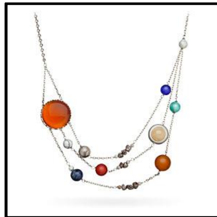
Solar Orbit Necklace: $29.99 on Thinkgeek.com