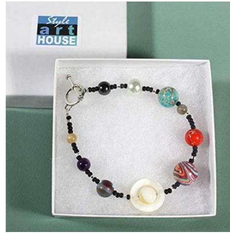
9-Planet Bracelet: $24.95 on Amazon.com