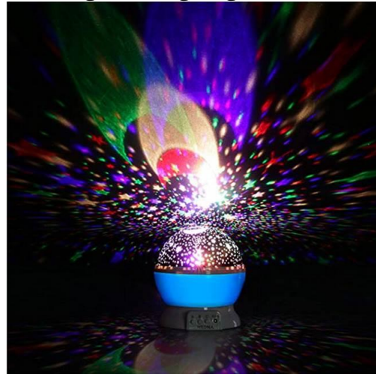
Pictured: Wedna 360 Rotating Galaxy Night Light $14.99 on Amazon.com