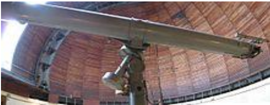
The 65 cm Zeiss achromatic refractor of Pulkovo Observatory

Even before the end of the war, the Soviet government made a decision to restore the Observatory. In 1946, it began the construction after having cleared the territory. In May 1954, the Observatory was re-opened, not only having been restored but considerably expanded in terms of instruments, employees and research subjects. New departments had been created, such as the Department of Radio Astronomy and Department of Instrument Making (with its own optical and mechanical workshop). The surviving old instruments were repaired, modernized and put into service once again. Also installed were new instruments, such as the 26-inch (660 mm) refractor, a horizontal meridian device, a photographic polar telescope, a big zenith telescope, stellar interferometer, 2 solar telescopes, coronagraph, a big radio telescope and all kinds of labware. The 65 cm Zeiss refractor was originally intended as a gift from then Chancellor of Germany Adolf Hitler to the Italian Benito Mussolini, but it was not delivered and instead was recovered by the Soviet Union.