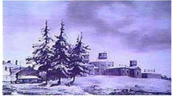
Pulkovo Observatory in 1839

The observatory was opened in 1839. Originally, it was a brainchild of the German/Russian astronomer Friedrich Georg Wilhelm von Struve, who would become its first director (in 1861, his son Otto Wilhelm von Struve succeeded him). The architect was Alexander Bryullov. The observatory was equipped with state-of-the-art devices, one of them being the 15-inch (380 mm) aperture refractor, one of the largest refractors in the world at that time. In 1885, the observatory was equipped with 30-inch (760 mm) refractor, which was the biggest usable refractor in the world, until the 36-inch (910 mm) telescope at the Lick Observatory in California a few years later. Both were built by Alvan Clark & Sons in Massachusetts. The principal line of work of the observatory consisted of determination of coordinates of stars and astronomical constants, such as precessions, nutations, aberrations and refractions, and also discovering and measuring double stars. The observatory's activities have also been connected to the geographical study of the territory of Russia and development of navigation. The star catalogues, containing the most precise positions of 374, and then 558 stars, were made for the years 1845, 1865, 1885, 1905 and 1930