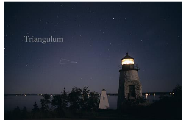
The constellation Triangulum as it can be seen with the unaided eye.

In addition to galaxies, Triangulum also has a few decent double stars and a reasonable open cluster.