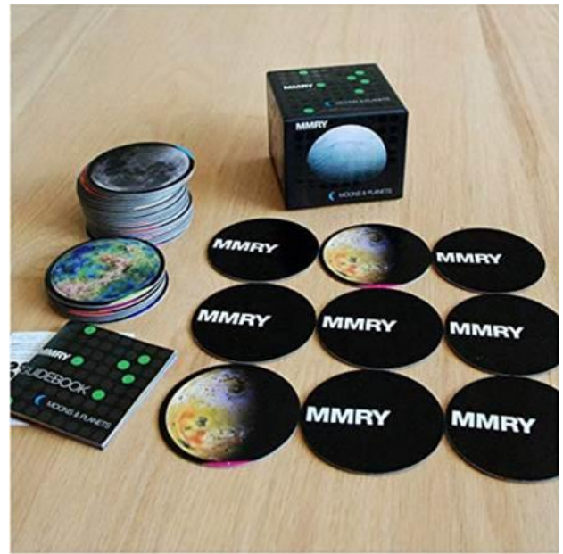
Pictured: Copernicus MMYR: Moons and Planets Game $17.52 on Amazon.com