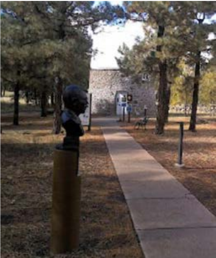
The walkway to the observatory.