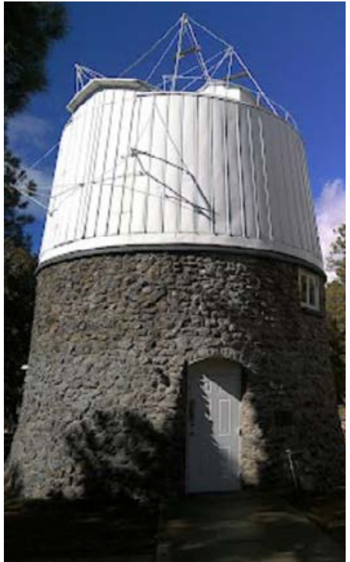
Building housing the 13-inch astrograph.