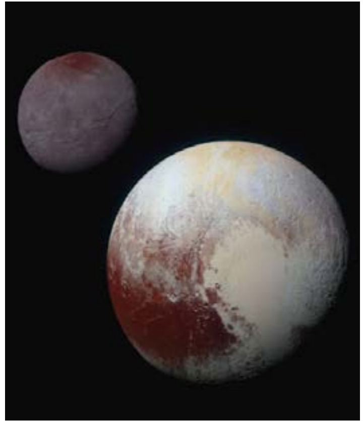
Charon and Pluto.