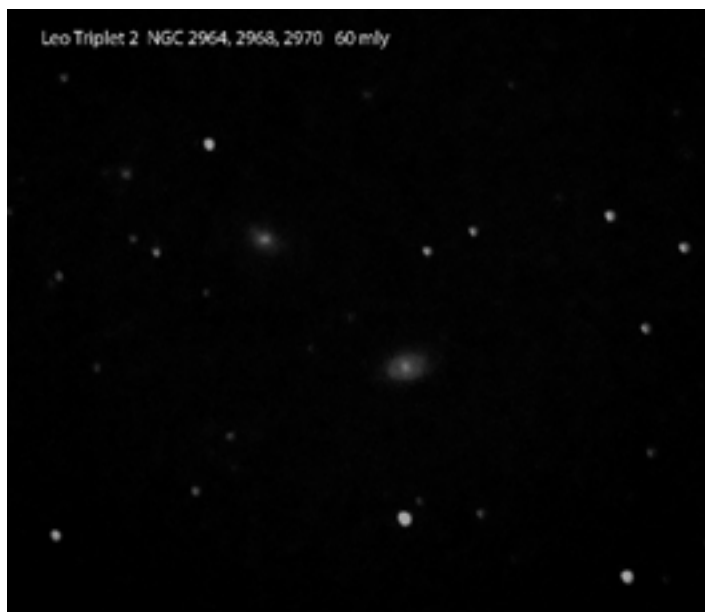
The Forgotten Leo Triplet.

We are all familiar with the Leo Triplet consisting of M65, M66, and NGC 3628. But there is another little-known group known as the Leo Triplet 2 or the Forgotten Leo Triplet. The group consists of NGC 2964, NGC 2968, and NGC 2970. They are located above the head of Leo. They constitute a gravitationally bound group that is located between 60 and 80