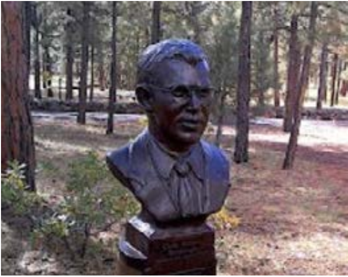
Bust of Clyde Tombaugh.

spacecraft. So if you happen to be in Flagstaff, Arizona, sometime, it is well worth stopping for a visit!