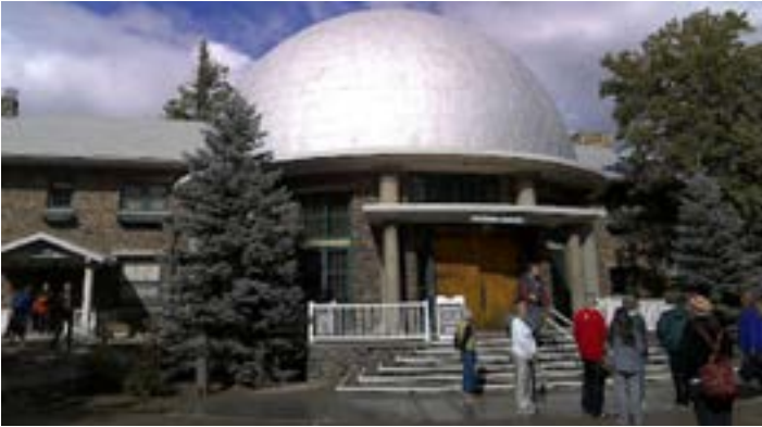
The Saturn building.

Our tour guide led us along a path toward the