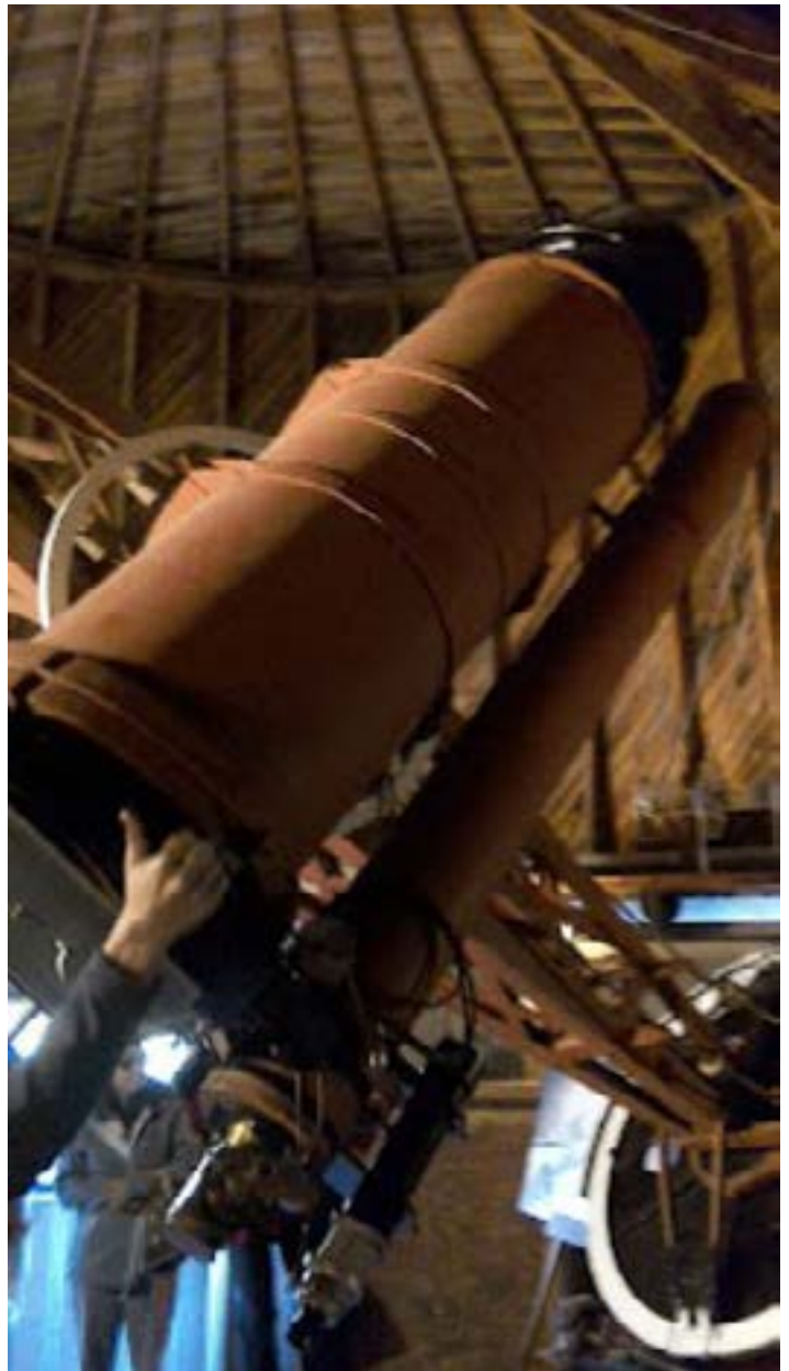
The 13-inch Lawrence Lowell Telescope.

From there, we walked up a small stairway into the room where the telescope was located.