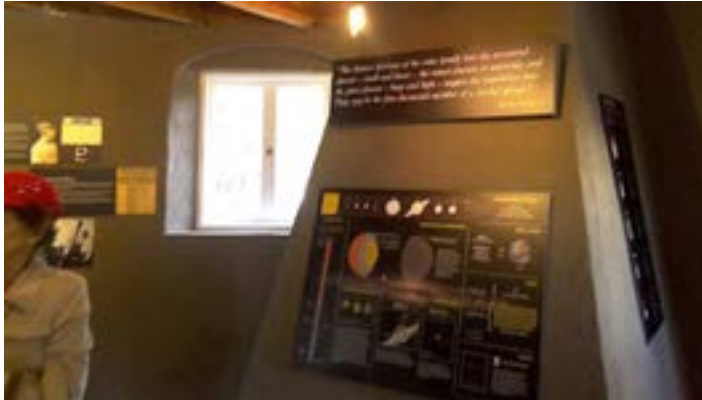
Large concrete pier.

building that houses the 13-inch Lawrence Lowell Telescope. This path has a bust of the famous Clyde Tombaugh, who discovered Pluto on February 18, 1930. He was using a device called the blink comparator to view some photographic plates and noticed a small dot that shifted its place among the background stars. The small dot turned out to be none other than Pluto. This discovery made this telescope famous