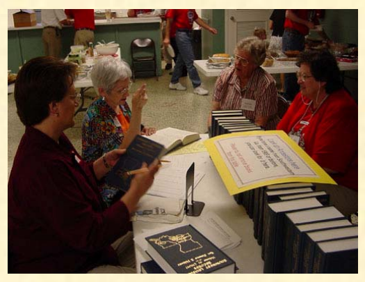
Getting help with Genealogy