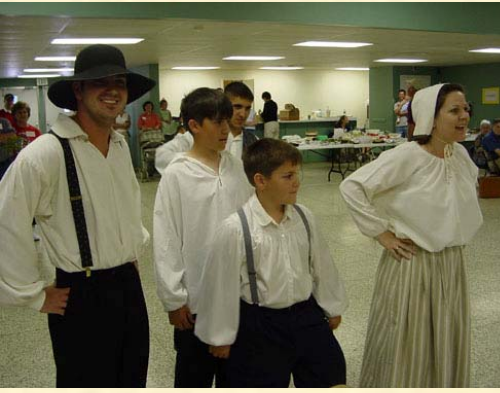
Going to show how it was done!