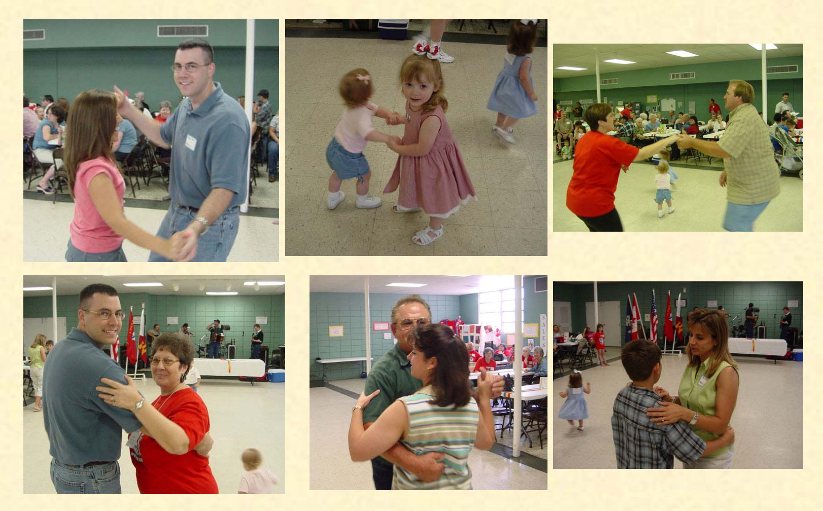
Cajun Dancing in the afternoon! It doesn't get any better than this !