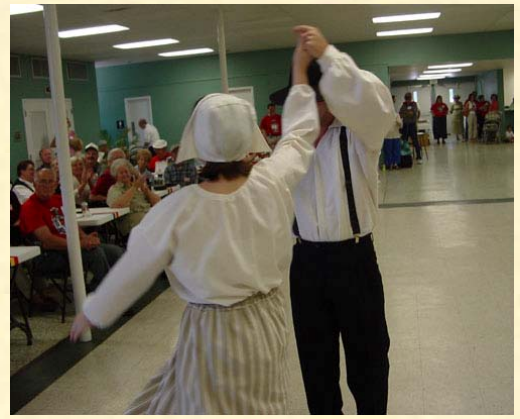
This is how it was done!