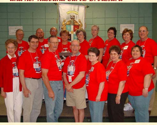
The whole gang !