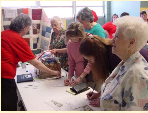
Everyone wants to win the raffle