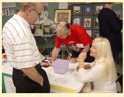
Buying the winning ticket?