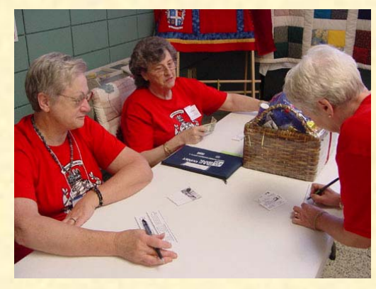
Buying Chances for Quilt Raffle