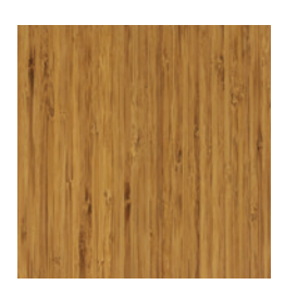
HT Bamboo 4-QCP-30 LRV N/A