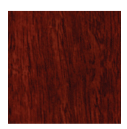
Mahogany 4-QAE-30 LRV N/A