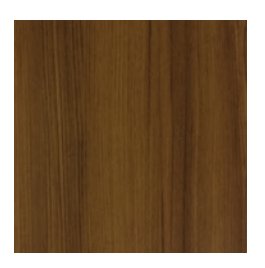
4-QBB-30 LRV N/A

ALPOLIC® Pattern Series has the look of real wood and steel at only a fraction of the weight. It's perfect for building cladding, modular buildings, fascia, accent bands, canopies, column covers and signage. Its combination of durability and natural beauty makes this series a classic.