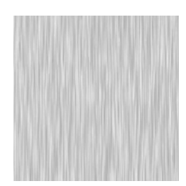
Brushed Metal 4-FZZ-15 LRV N/A