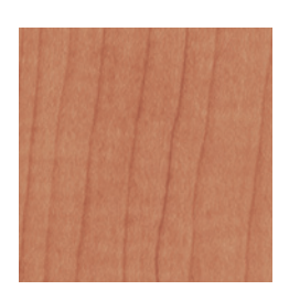
Maple 4-MPL-30 LRV N/A