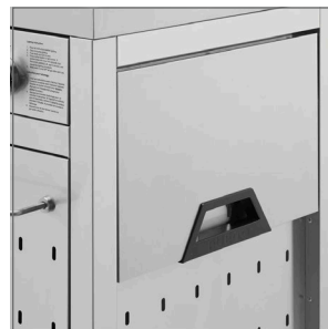
Recessed Side Shelves