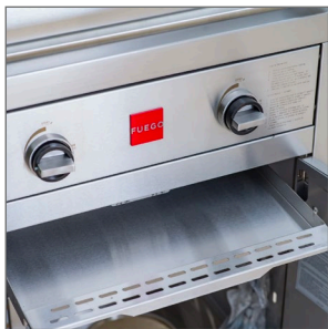
Hidden Residue Tray