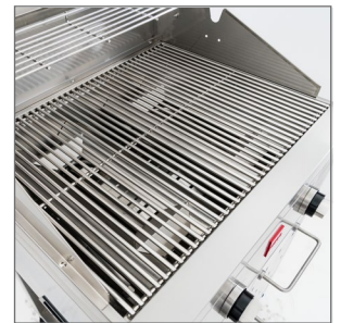
Heavy Duty 8mm Grates