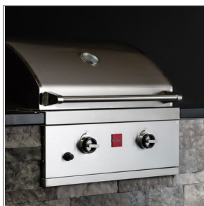
Sleek Front Panel Design