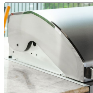
Easy Mount Side Brackets