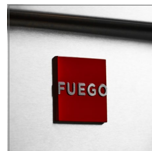
Limited Lifetime Warranty