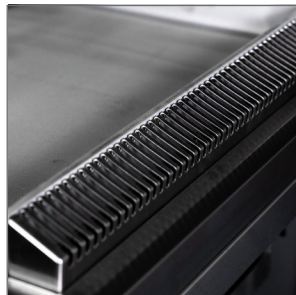
Rear Top Vents