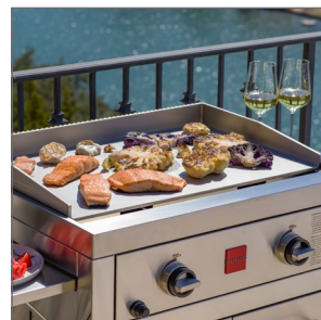
Meat, Veggies & More