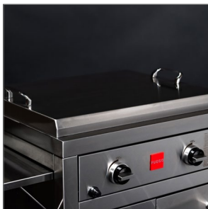
Griddle Top Cover