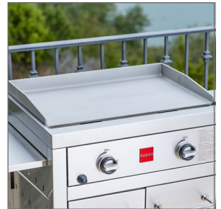
Heavy Duty 8mm Griddle