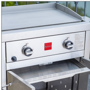
Hidden Residue Tray