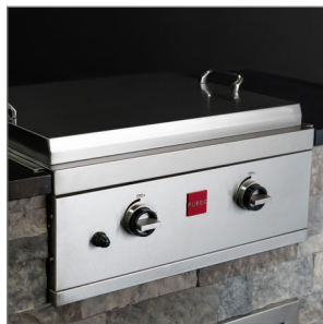
Sleek Front Panel Design