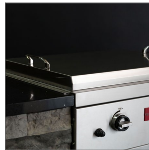
Griddle Top Cover