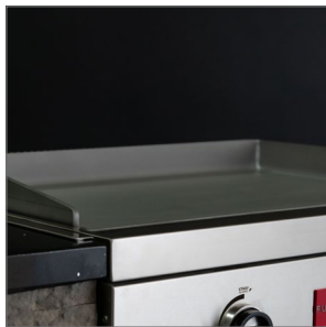
Heavy Duty 8mm Griddle