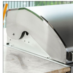
Easy Mount Side Brackets