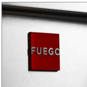
Limited Lifetime Warranty