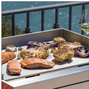
Meat, Veggies & More