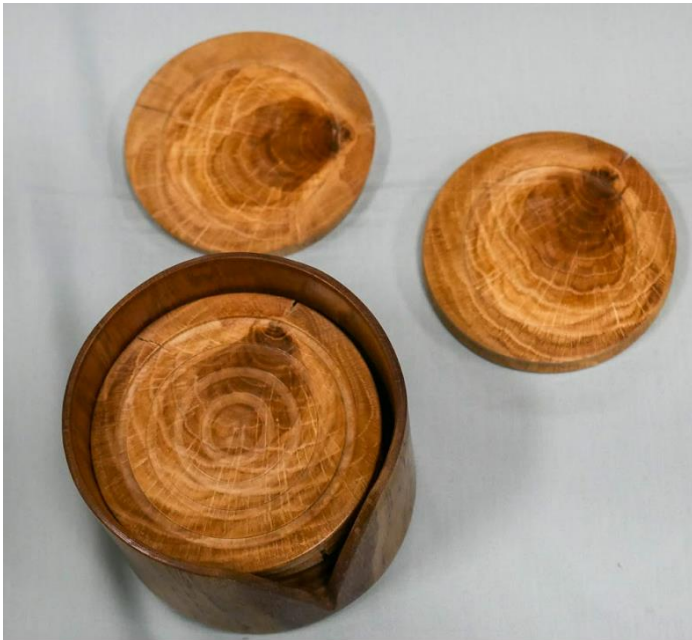
2 nd Phil Walters