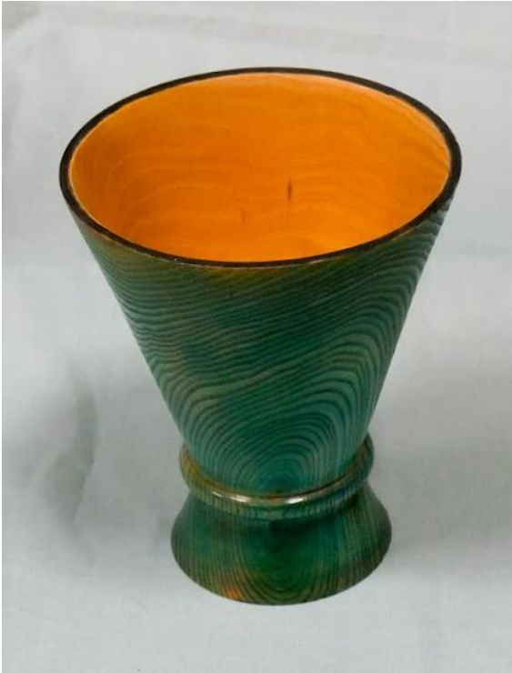
3 rd = Grahame Tomkins