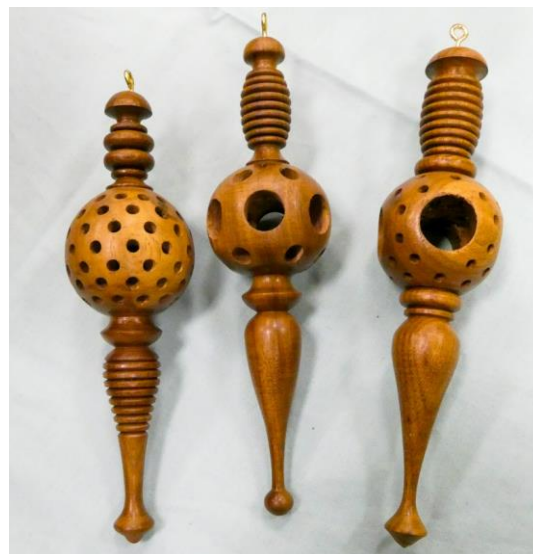
2 nd Phil Scotock