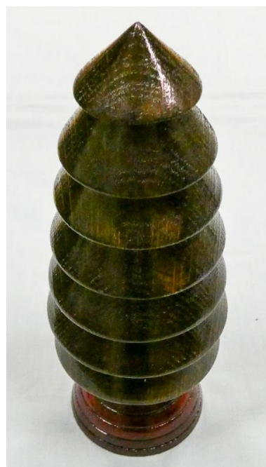
3 rd Pete Pocock