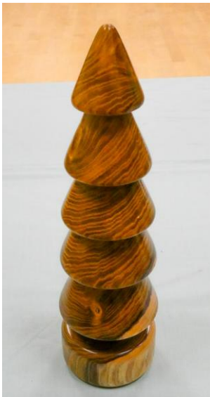
2 nd Alan Wigginton