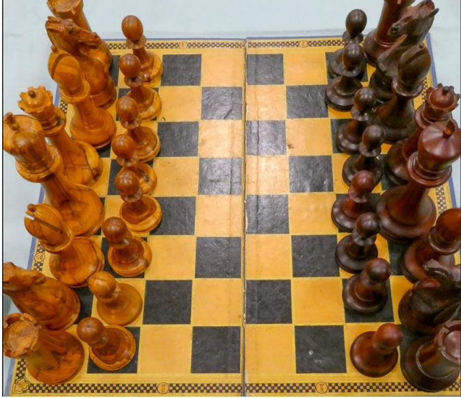
1 st Geoff Selley