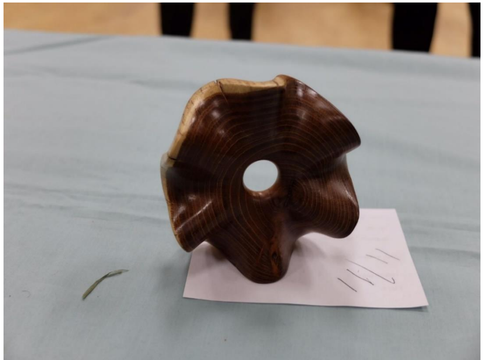
1 st Place - Peter Hoare