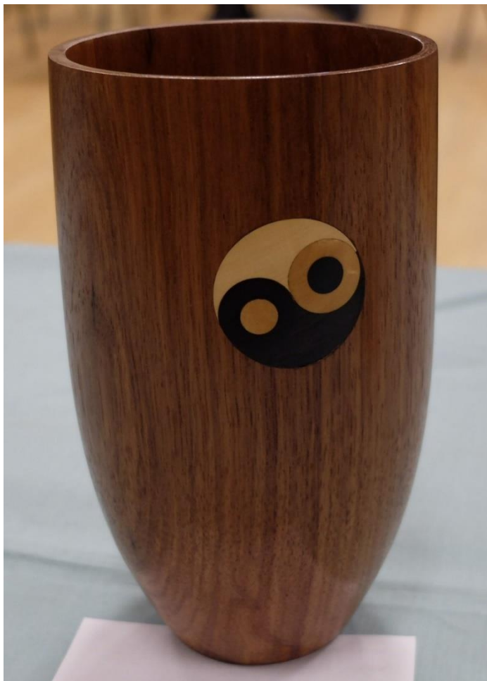
2 nd Place - Don Guy