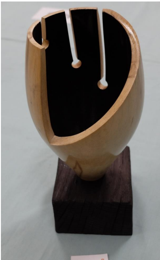
3 rd Place – Don Guy