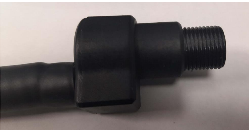
Picture 3:- If your drive cable is 2.55mm, remove pin & white extension adapter