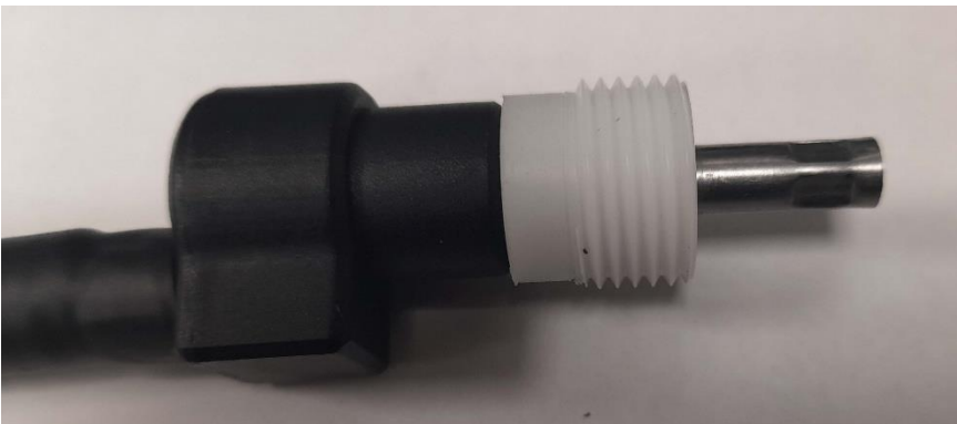
Picture 2:- If your drive cable is 2.70mm, use pin & white extension adapter