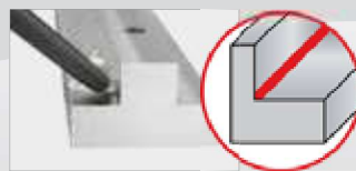
Inner Straight Corners For Sets: U, G3