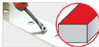
Flat Surface For Sets: C, D, HC, K, U