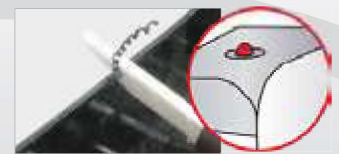
Mold Gate Trim