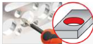
Hole Inner Surface For Sets: C, HC, U