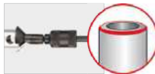
Outer Edge For Sets: Burr-Ex, L