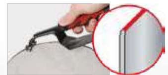
Sheets For Sets: D, Burr-Bi