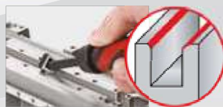
Slot Keyways For Sets: G, U