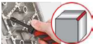
Straight Edge For Sets: B, C, E, HC, M, 1, Burr-Bi