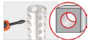
Cross-Hole Both Edge For Sets: E, M, 1