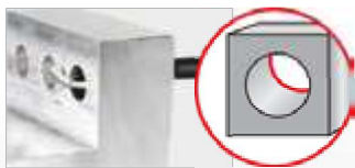
Hole Back-Edge For Sets: C, E, HC, U