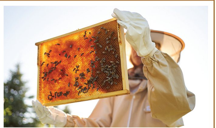
A beekeeper in protective gear handles a frame from the hive box where bees build their hives with wax and honey.