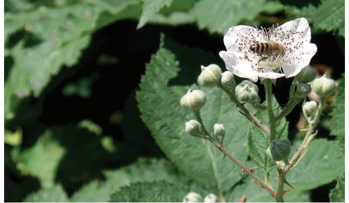
A honey bee pollinates a Himalayan blackberry flower—a plant that is invasive in many places.