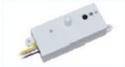
Motion Sensor-Microwave (Internal) 120-MSU-CP/VT-BMD