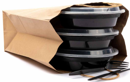
Microwavable Takeout | Tamper-Evident | Hinged | Two-Piece | Embossable

Convenience store packaging is all about speed, accessibility, and instant gratification. These packages are designed for on-the-go customers who need quick and hassle-free access to snacks, beverages, and daily essentials.