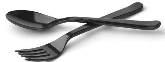
Cutlery Kits | Wrapped Cutlery | Napkins | Tissue | Paper Rolls | Printable