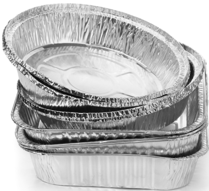
Traditional Silver | Gold | Black | Dual-Ovenable | Customizable