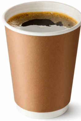
Double Wall Paper | Single Wall Paper | Cold Cups | Printable