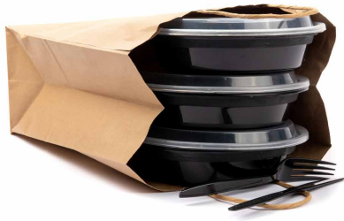
Microwavable Takeout | Tamper-Evident | Hinged | Two-Piece | Embossable