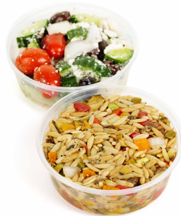
PET Deli | PP Deli | Injection Molded Deli

Grocery packaging serves as the frontline ambassador for countless products on store shelves. It's not merely a protective shell but a vital means of conveying information, ensuring freshness, and enhancing the shopping experience.