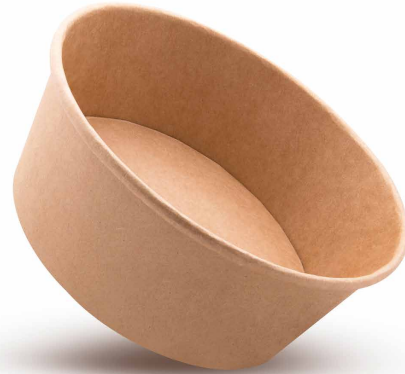
Food Buckets | Fry Scoops | Food Trays | Paper Food Containers | Printable