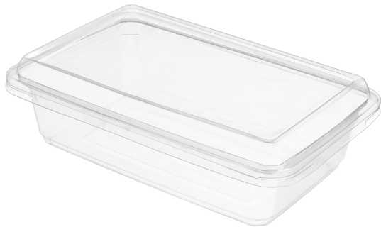
Tamper-Evident | Hinged | Two-Piece | Film Sealable | Multi-Colored