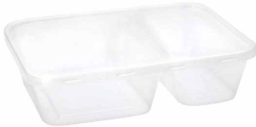
Rigid | Tamper-Evident | Hinged | Cold Foods | Hot Foods