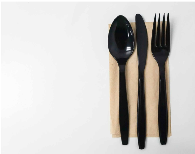
Cutlery Kits | Wrapped Cutlery | Napkins | Tissue | Paper Rolls | Printable