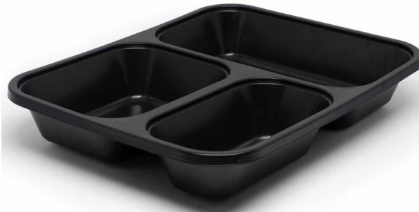
CPET | Dual-Ovenable | Film-Sealable