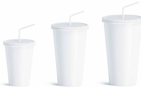
PET Cups | PP Cups | Cold Cups | Single & Double Wall Cups | Printable