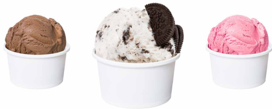
Ice Cream & Yogurt Containers | Soup Containers | Printable