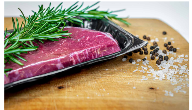
Lidding Film | Skin Packs | Flexible Films | Laminated Paper Films