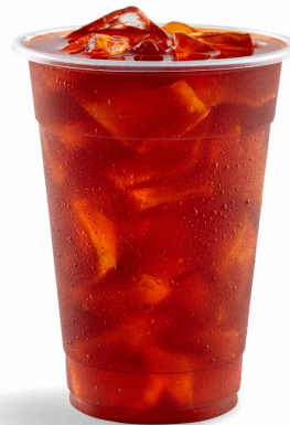
PET Cups | PP Cups | Printable