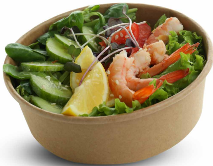
Food Buckets | Fry Scoops | Food Trays | Paper Food Containers | Printable