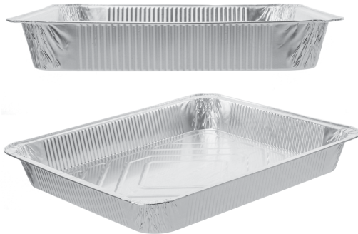
Steam Pans | Rounds | Rectangles | Foil Rolls | Dual-Ovenable | Colored