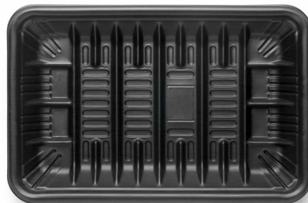
Protein Trays | Produce Trays