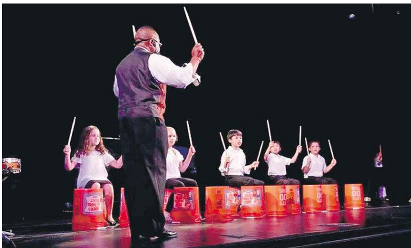
NAPOLÉON REVELS-BEY'S COLLECTIO