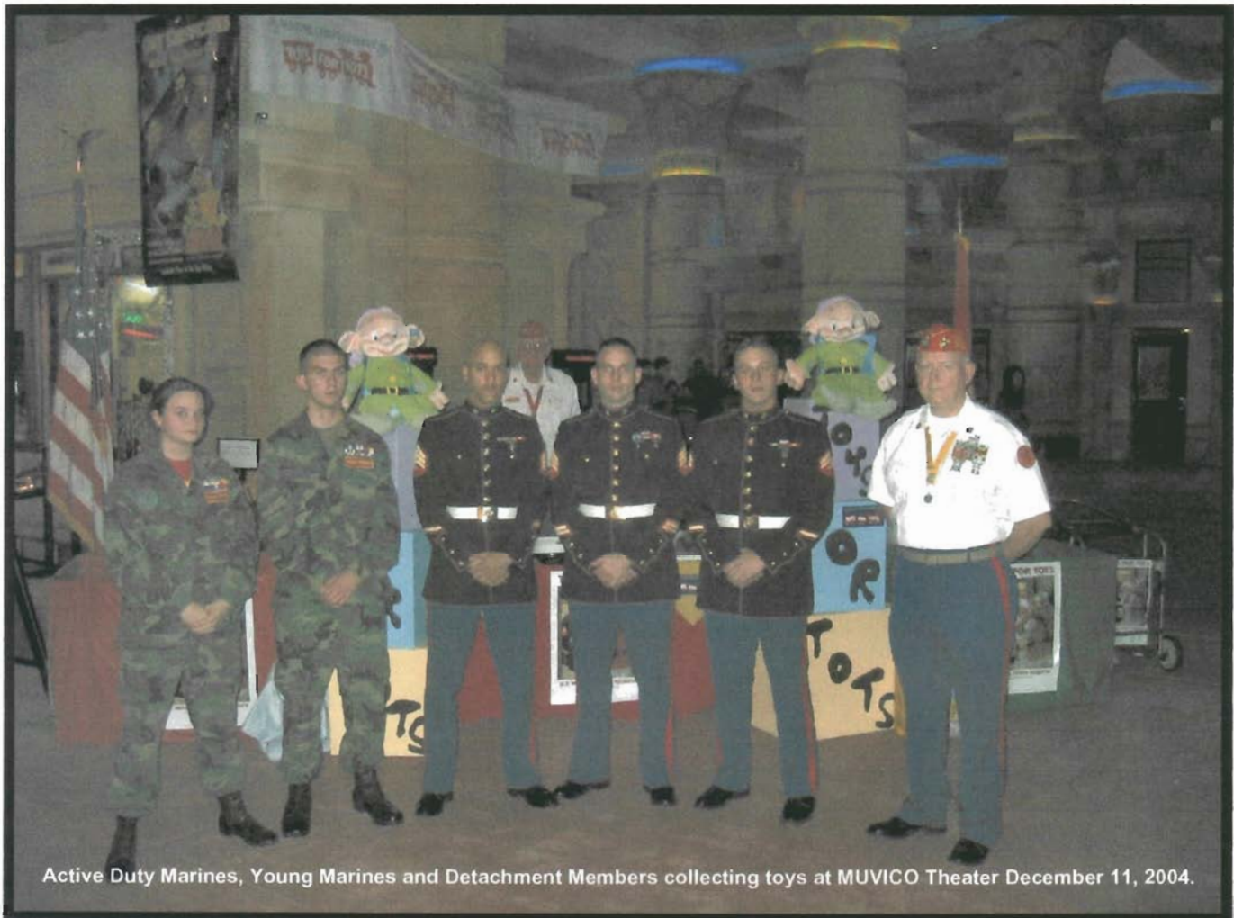
Active Duty Marines, Young Marines and Detachment Members collecting toys at MUVICO Theater December 11, 2004.