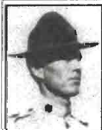
WILLIAM R. BUTTON Corporal United States Marine Corps Medal of Honor — 1919 Haiti