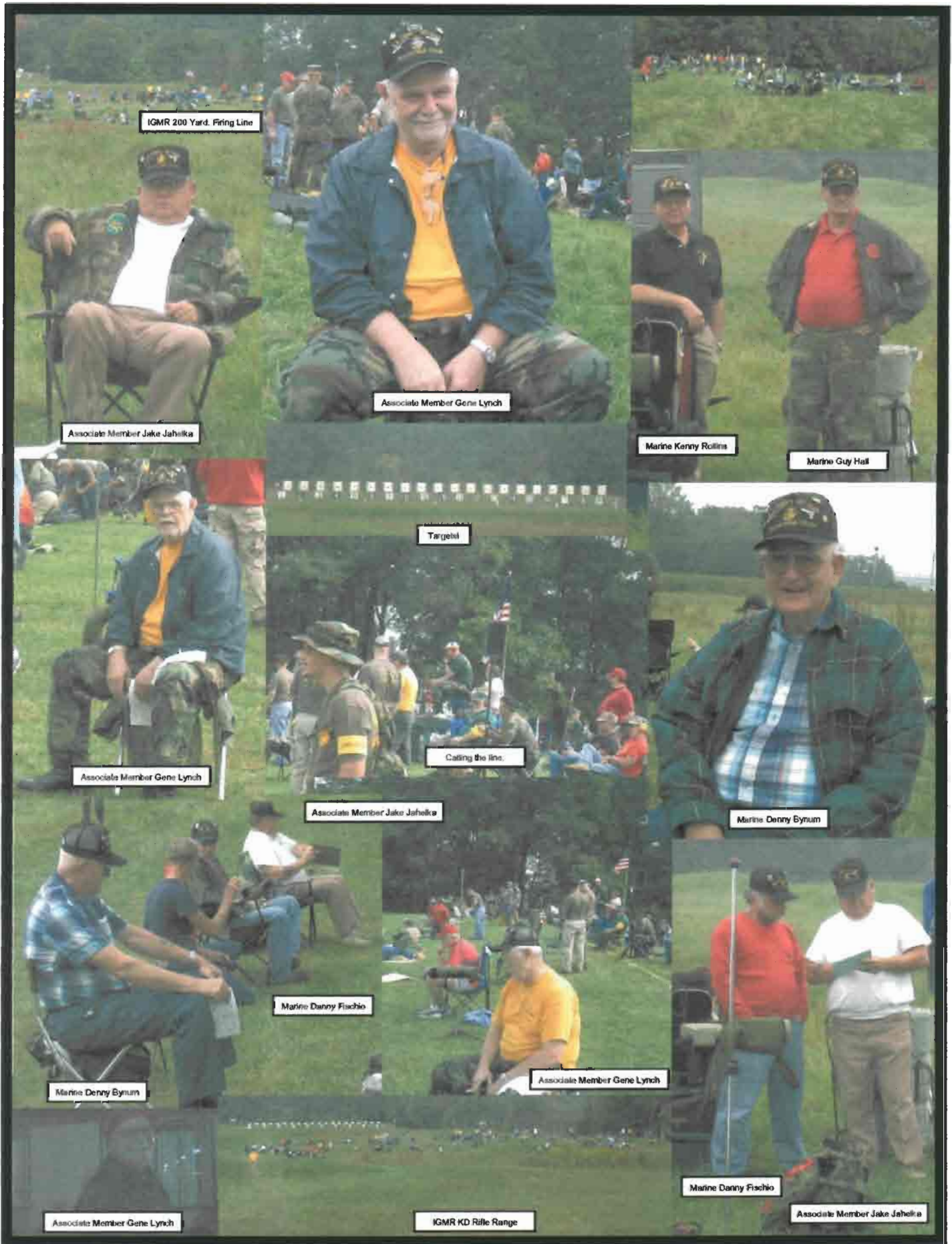
IGMR 200 Yard. Firing Line