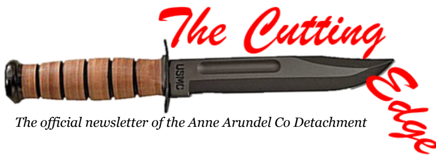
The official newsletter of the Anne Arundel Co Detachment