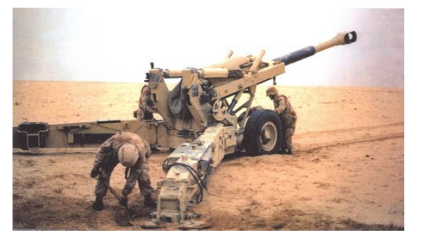
US Marines fire a 155 mm artillery piece during Desert Storm