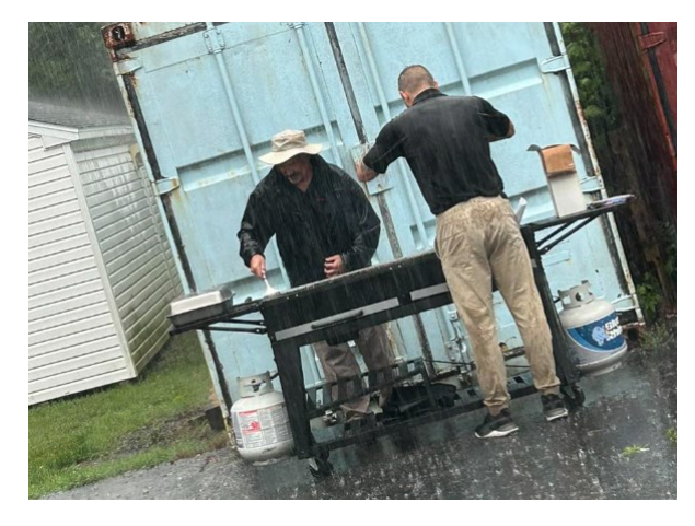
The burgers may have gotten wet, but the rain didn't dampen the spirits of the YMs.