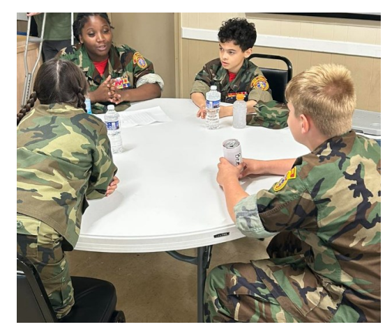
Breakout sessions to discuss various drug related scenarios.