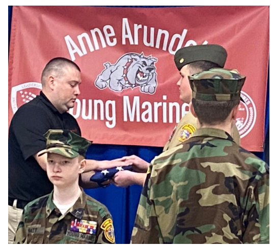
The Young Marines presented the out-going commander with their Unit Parade Colors.