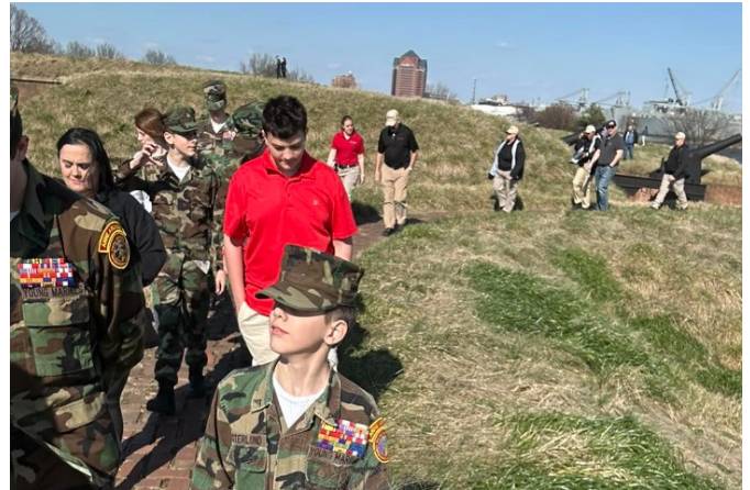
Walking the ramparts. Fortunately, no red glare today.