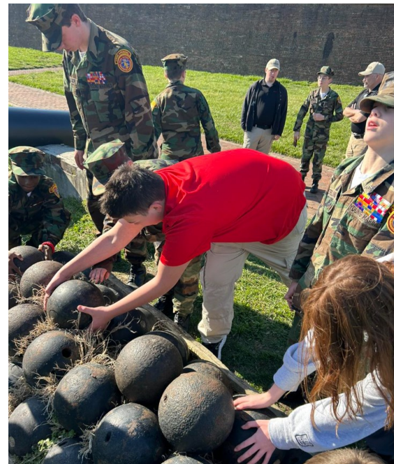
Playing with cannonballs. What could possibly go wrong?