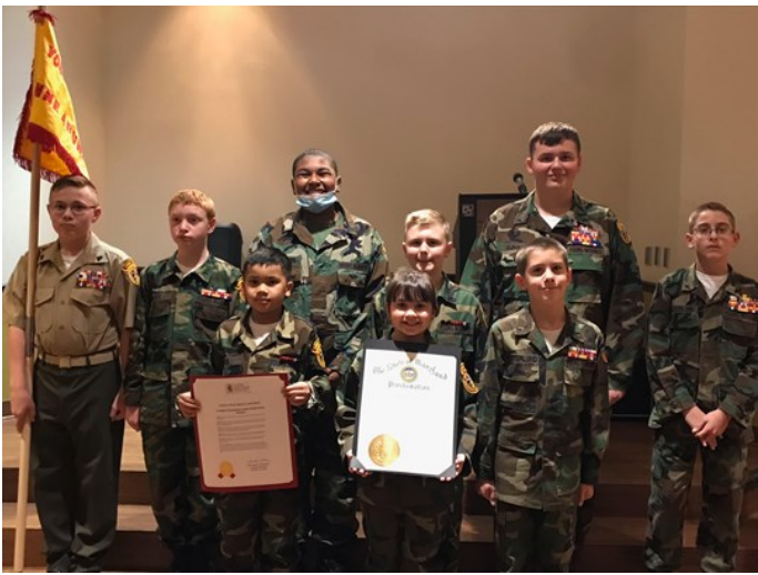
Anne Arundel Young Marines with the State of Md and AACo Red Ribbon Week proclamations.