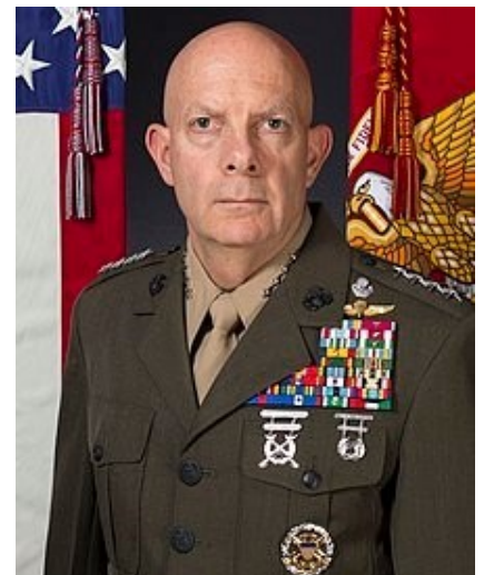
David H. Berger General, U.S. Marine Corps Commandant of the Marine Corps