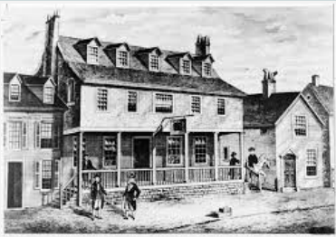
The old Tun Tavern, Philadelphia