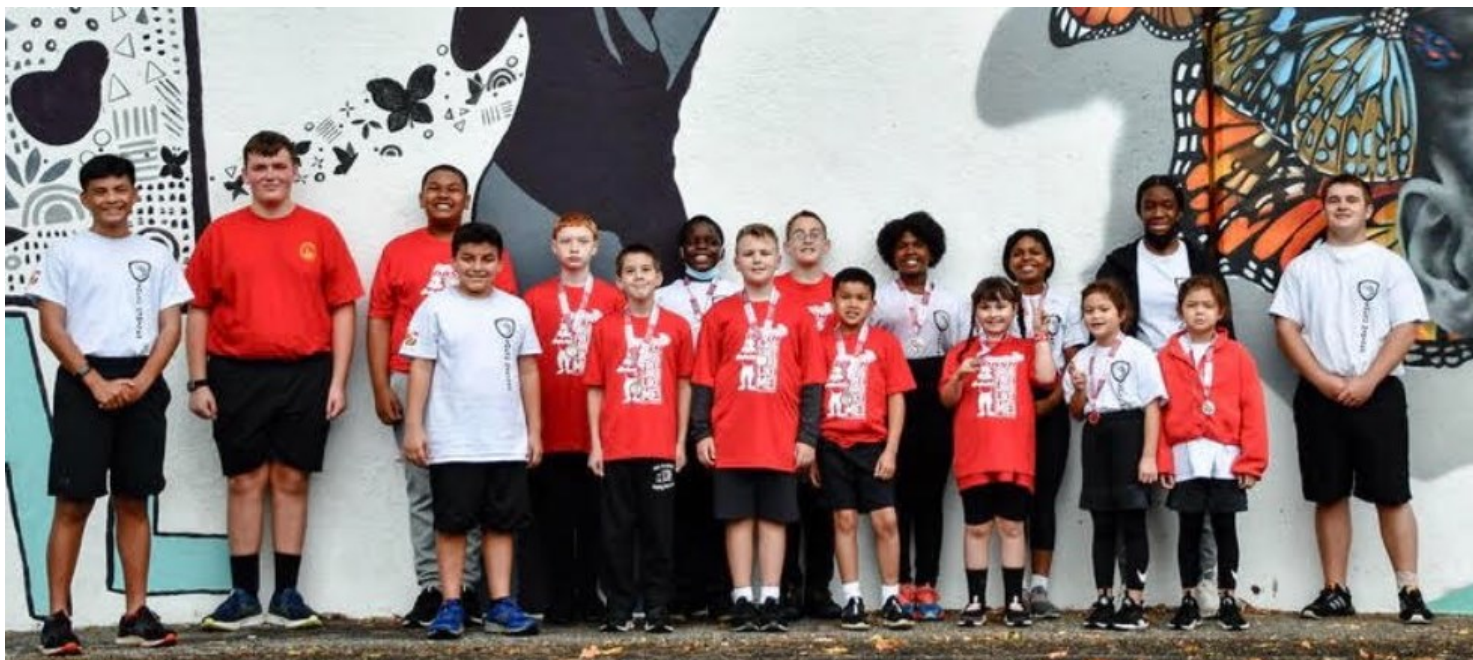
Anne Arundel Young Marines and Historic Elkrige Young Maines-DDR Dash