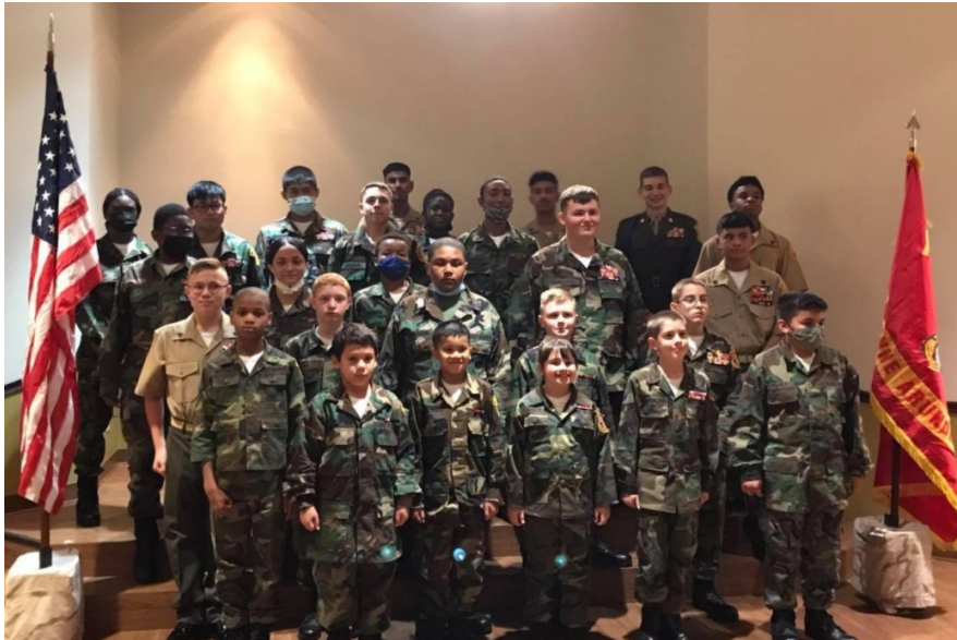
Group Photo—Young Marines Ball