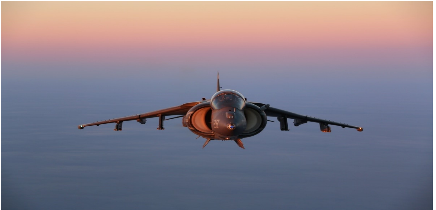
An AV-8B Harrier belonging to 2nd Marine Aircraft Wing, maneuvers into position during an air-to-air refuel training exercise over the Atlantic Ocean Sept. 14, 2015.

On Thursday 15 October the Marine Corps held a sunset ceremony for Marine Attack Squadron 311, or VMA-311, as the Corps looks to move from the AV-8B Harrier to the F-35 Lightning, according to the Marine Corps.