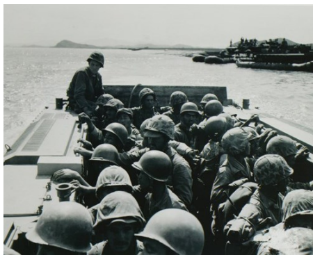
(Photo: American and Korean Marines cross the Han River in an LVT-3C amphibious tractor from the 1st Amphibian Tractor Battalion.)

Marines cross the Han River northwest of Seoul, Korea. Five days later the 1st and 5th Marines attack Seoul and by the 27th had captured it.