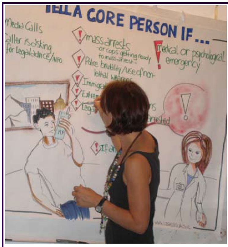
Example of live facilitation, during training of call center staff of legal non profit organization.