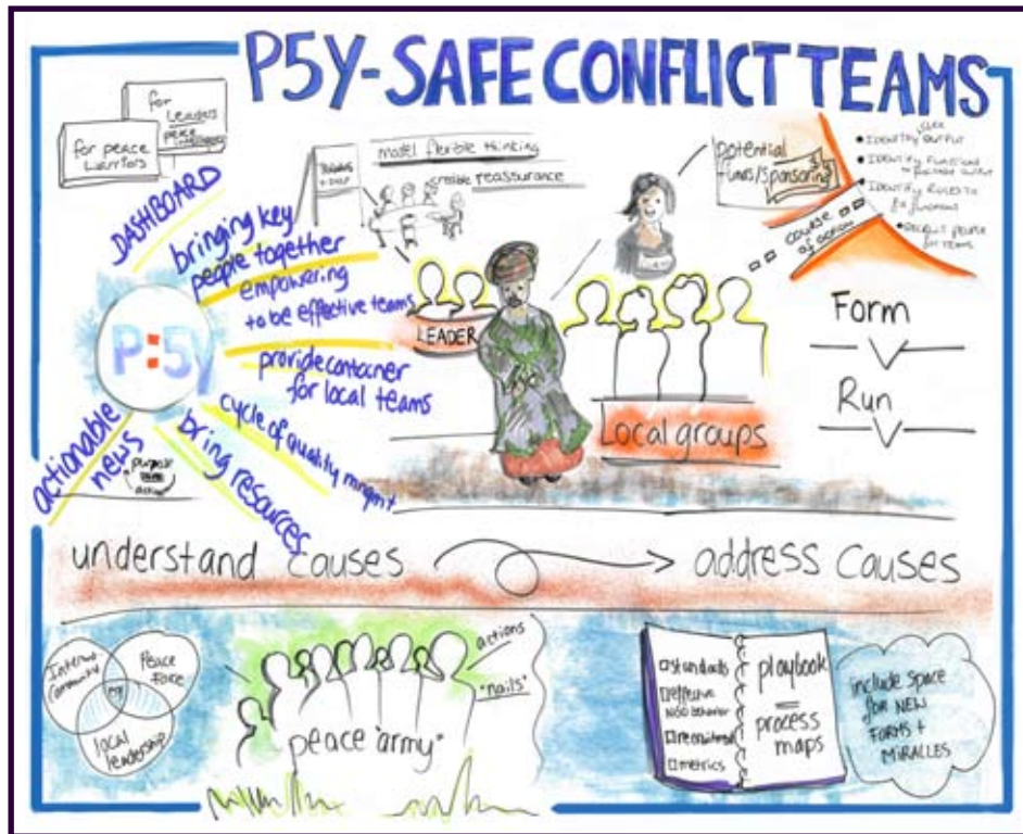
Example of a strategic vision map, created during a meeting for P5Y- Give Peace a Deadline, in Boulder, Colorado.