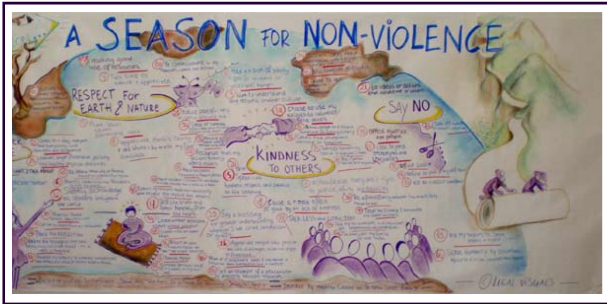
Example of studio map, based on informational materials of 'The season for Peace and Non Violence' in the Denver area.