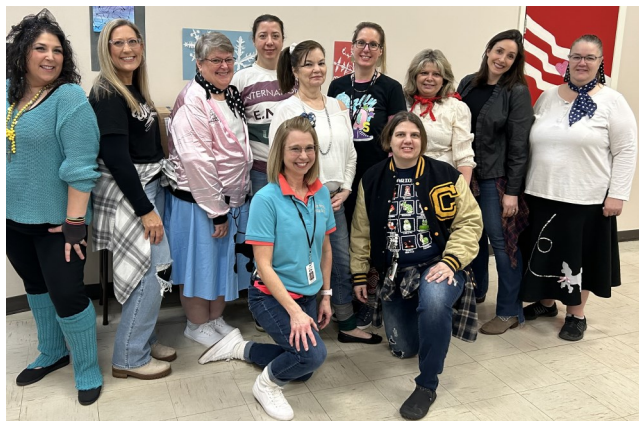
CHCS staff rocking the decades for Throwback Thursday.