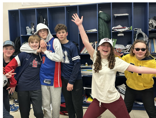
Seventh grade students pose in their favorite sports team apparel.