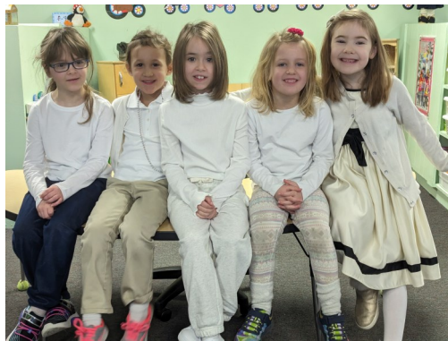
White Out Wednesday.